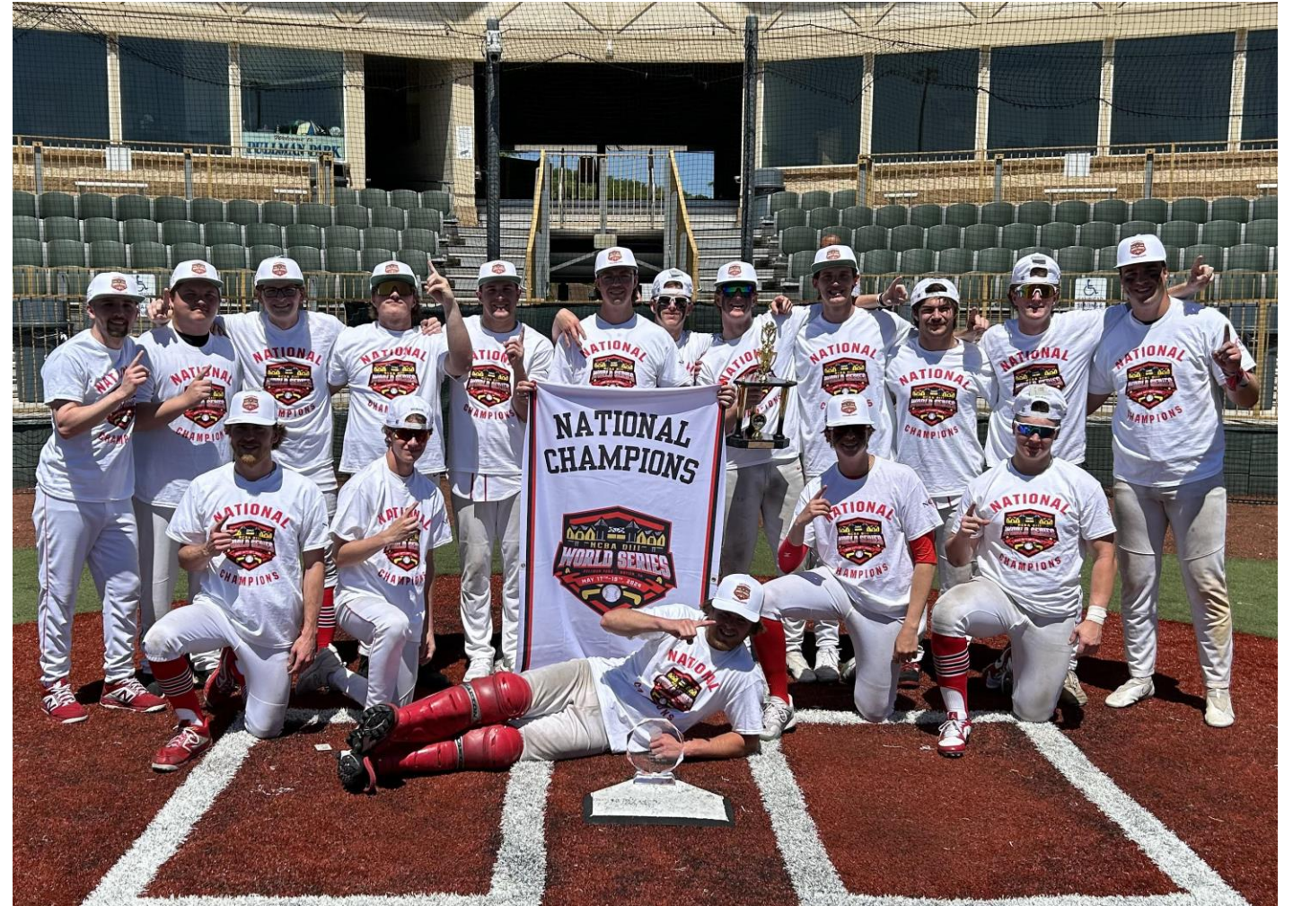
2024 DIII World Series Champs – Univ. of Wisconsin River Falls